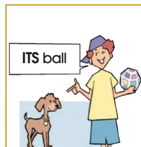
ITS + SINGULAR NOUN