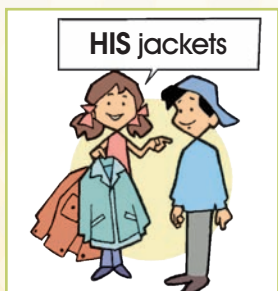
HIS + PLURAL NOUN