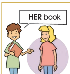
HER + SINGULAR NOUN