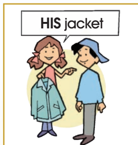
HIS + SINGULAR NOUN