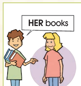
HER + PLURAL NOUN