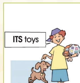
ITS + PLURAL NOUN