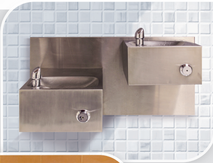
WATER FOUNTAINS OR DRINKING FOUNTAINS